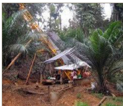
Medusa Mining exploration in the Philippines